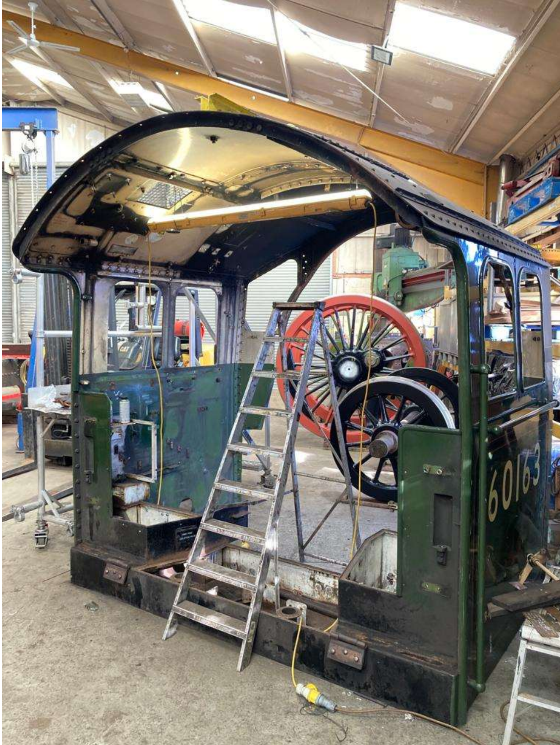
Conduits and other components have been removed from the cab before it goes for shotblasting.