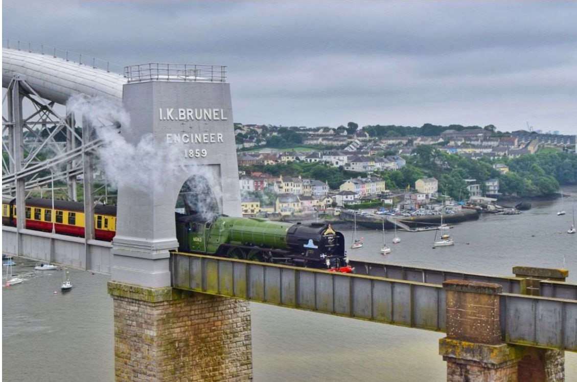
Tornado on the Royal Albert Bridge

Tornado will return in spring 2023. The following tours are available to book: