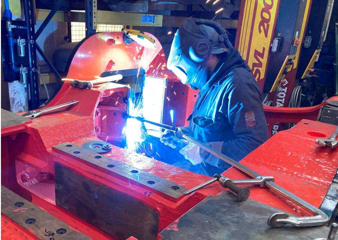
The new manganese liners have been welded on the bogie horns.